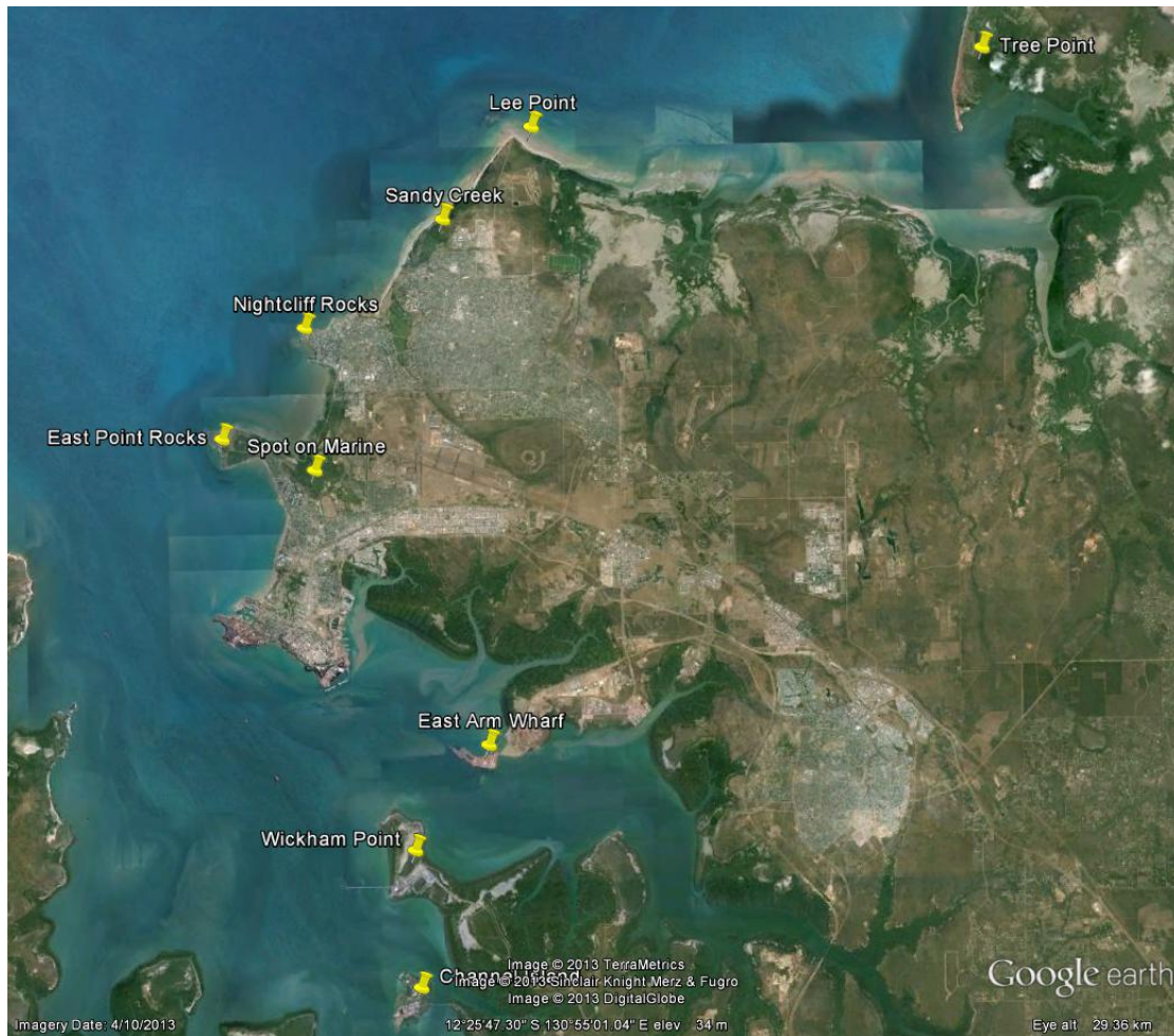
Figure 1. Known roost sites in the Darwin Harbour region.

There are several known habitat sites used by migratory shorebirds in the Darwin Harbour region (Figure 1). In addition, satellite image were used to investigate potential habitat areas. The minimum distances from the East Arm Wharf roost site to other known roost sites are shown in Table 3. Using satellite imagery, additional potential roost sites for migratory shorebirds have been identified based on habitat environmental attributes that have been correlated with shorebird presence, abundance and species composition (Figure 3). Most of these sites will be investigated for ground-truthing of habitat characteristics and surveyed during the Austral summer season for roosting shorebird presence.